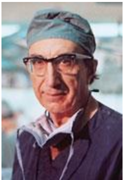
1998 Michael DeBakey, MD Tulane Cardiothoracic Surgery